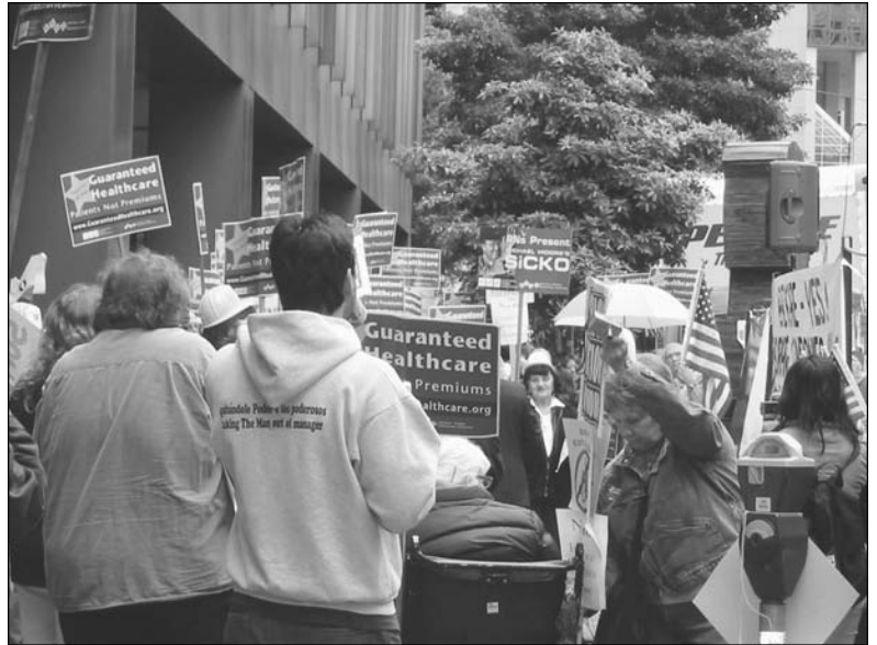
Supporters of SB 840 at a OneCareNow rally in front of Blue Shield's headquarters in San Francisco.

Currently, 25 percent to 45 percent of every health care premium is spent on overhead and profit. Medicare spends less than three percent of health care dollars on overhead. By reducing administrative overhead, eliminating profits and by pooling all current funds spent on health care, SB 840 covers every California resident with comprehensive benefits. An analysis by The Lewin Group, a nationally respected health care consulting firm,