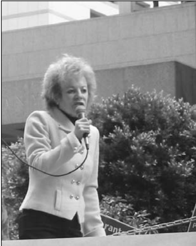
Senator Carole Migden addresses SB 840 supporters.

in the Schwarzenegger proposal also amount to taxes. In its drafting of AB 8, the Legislative Counsel has classified the employer assessment as a fee because it alone determines eligibility in Cal-CHIP.