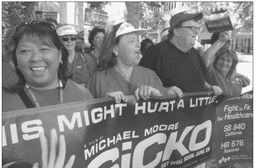
"No longer preaching to the choir!" Filmmaker Michael Moore joins California nurses and health care advocates at a rally for SB 840 at the State Capitol. Photo by Jaclyn Higgs. Used with permission.

Employers currently cover 18 million Californians, while public insurance programs like Medicare, Medi-Cal and Healthy Families, account for 10 million. One million purchase health insurance in the individual market, leaving 7 million without health insurance. Schwarzenegger's proposal contains an individual mandate requiring everyone to have health insurance. Those not covered by their employer or a government program would be required to purchase health insurance on their own. AB 8