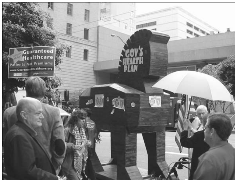
Governor's healthcare plan, depicted as a Trojan Horse, is an insurance industry favored plan. Photo by Dale Richter

Those ineligible for the state pool would be required to purchase at minimum a policy with a $5,000 deductible ($7,500 for a family). Out-of-pocket expenses would be