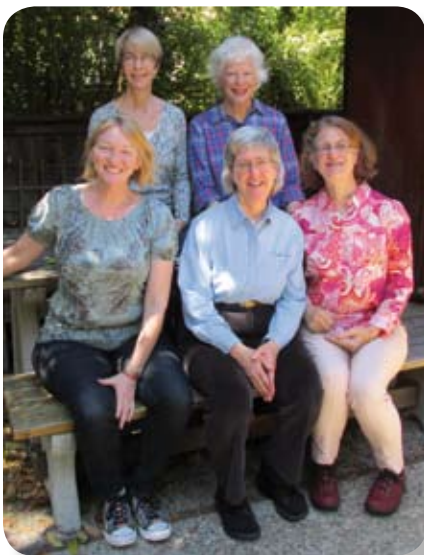
From the Steering Committee:

The 50th Harvest Festival will be both a reminiscence of our early days as well as what we hope will be a launching of the next 50 years of supporting this wonderful and effective lobbying group, FCLCA! We will have participation this year from other meetings which will harken back to old times as well as bring new ideas and new energy. We are all looking forward to the Big Event and have been inspiring each other, and we have already been delighted to find so many commonalities among our meetings. Once again, we are discovering that Harvest Festival is all about community!